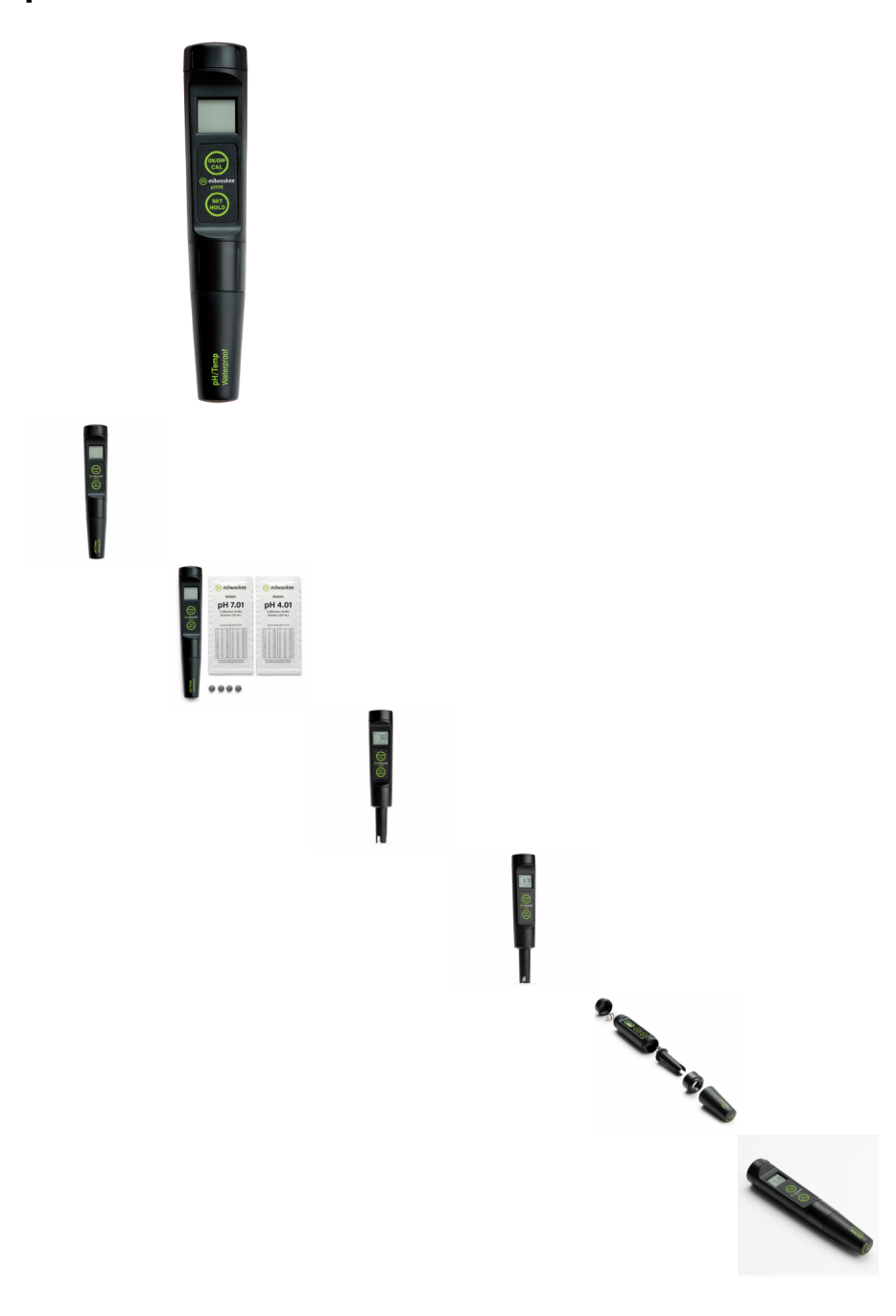
PRO pH / Temperature Meter with replaceable electrode