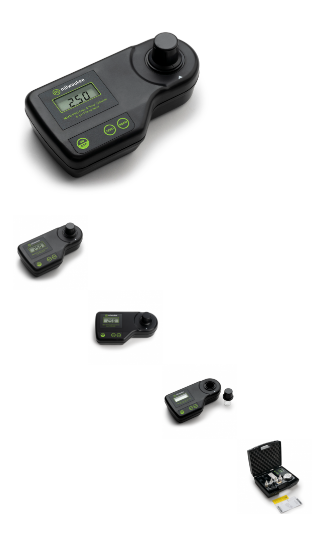
Free & Total Chlorine and pH Professional Photometer

Rating: Not Rated Yet Ask a question about this product